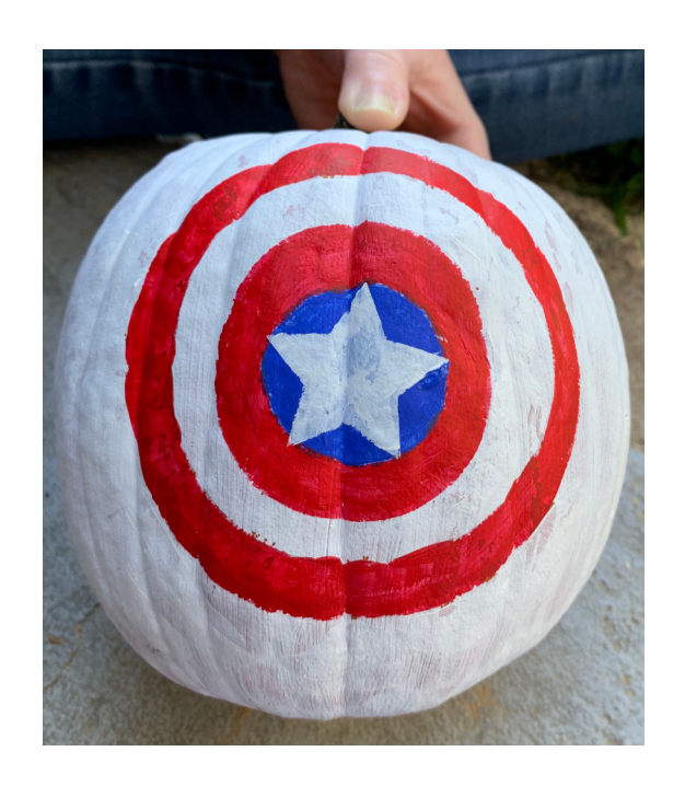
<u>Step 31:</u> Let your pumpkin dry. After your pumpkin is dry, feel free to post a picture on our Facebook page Crosswind Elementary PTA to show us your masterpiece! We can't wait to see your awesome pumpkin!!